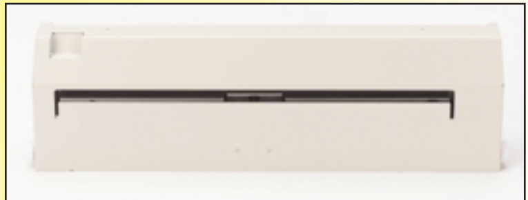
Guillotine Cutter B-7708-QM